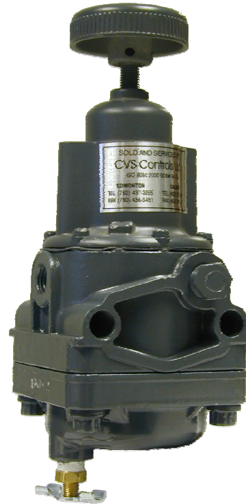
Figure 1: CVS Type 67AFR Regulator

In addition, these regulators contain integral low-capacity relief valves. In this type of construction the valve stem